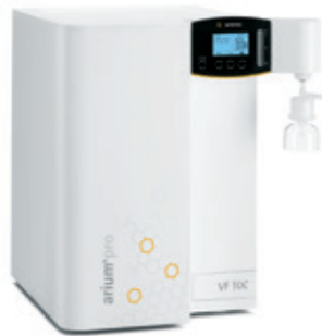
arium® pro Series Ultrapure water systems; any application-specific configuration can be selected.