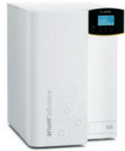
arium® advance Series Pure water systems