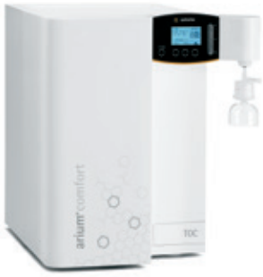
arium® comfort Series Combined pure and ultrapure water systems